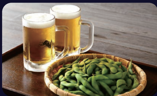
Lunch Japanese Tap Beer & Edamame $24.80 (2x400ml Sapporo Tap beer and 1 Edamame)